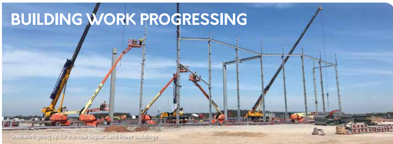
Steelwork going up for the new Jaguar Land Rover buildings

The first of the buildings to be completed will be DSV’s plot to the north east of the site, near the A444. The steelwork, roof and windows on the main warehouse, cross dock terminal and offices are now complete, and the external finishes are progressing well. Internal works are now underway ahead of the planned completion later this year.