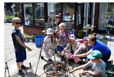
One for all, and all for fun. Toasting marshmallows at the Open Gardens scout camp.

Our Scouts were given the opportunity to join in with Tamworth District at the Staffordshire Big Camp for Scouts and Explorers with 950 other Scouts and Explorers from all across Staffordshire. All of the young people had a great time doing water activities like kayaking and canoeing, or activities like zip wire, abseiling and air rifle shooting. One of the favourite challenges was survival skills which involved gutting mackerel and cooking it—they smelled of fish for the rest of the day! Currently the group are looking for a Beavers leader, this is the section for children between 5 3 / 4 and 8 years old; we also need helpers for all the other sections. We are really struggling for support, so if you have any time that you could give to help the children experience new activities then please contact either Fiona Rouse on 07939 114360 or David Widdas on 07740 803807 . Please also use these contact numbers if your child is interested in joining us. All sections run on a Monday night at Austrey School and new members are always welcome. Thanks — Mark Neate – Scout Leader