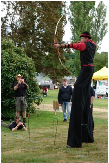
Whether you're tall or small archery is the Olympic sport that everyone, of any age or any level of fitness, can try.

www.austrey.co.uk , or email us at austreyarcherygroup@hotmail.co.uk .