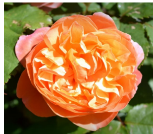
Roses were definitely the floral stars of the event!